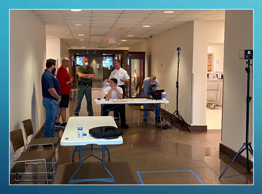
Broward County Sheriff's Office

RedSpeed proudly installed its thermal screeners in Miami-Dade County Emergency Operations Center and the Broward County Sheriff where it has been incorporated into access control for first responders.